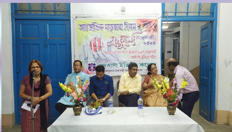
Observation of "Matribhasa Divas"(Day of Vernacular Language)