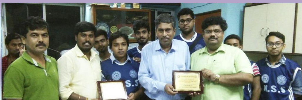
Achievement of the Best Program Officer award and Best Student Participant Award of NSS unit under University of Calcutta

<-NCC Assembly in the college Gate for observing Safe Drive Save lifeprogram of West Bengal Government