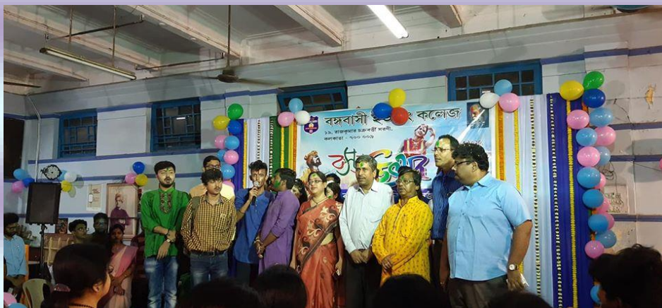
Celebration of "Basontotsob", the festival of colours