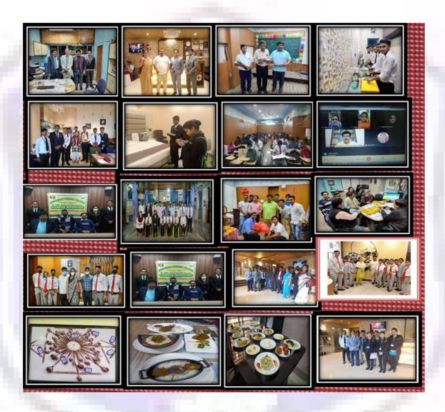
Some relevant pictures of all the activities of B.Voc. in Banking, Financial Services and Insurance and B.Voc. in Hospitality & Tourism, sponsored by UGC and Affiliated to University of Calcutta: