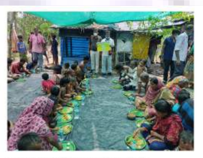
Participation of the college in distributing refuge in Vanda informed areas of Sanaharbon