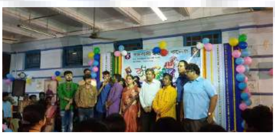
Celebration of "Basontotsob", the festival of colours