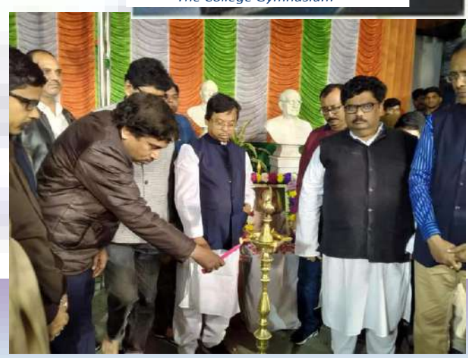
Observation of the Republic Day

There are two Common Rooms — one for the boys and the other exclusively for the girls. There is arrangement for various indoor games in the Common Rooms — table tennis, carom and chess. This facilitates recreational activities. Recently a Billiard board and two cricket sets has been purchased from RUSAfund.