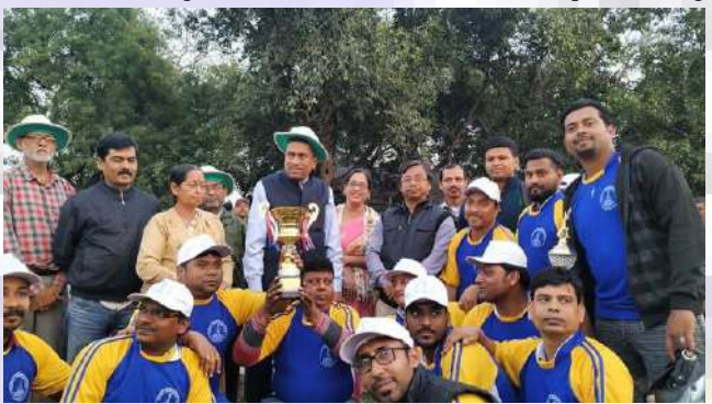
Students' Union in the

There are arrangements for indoor and outdoor sports and games- under the guidance of Sri