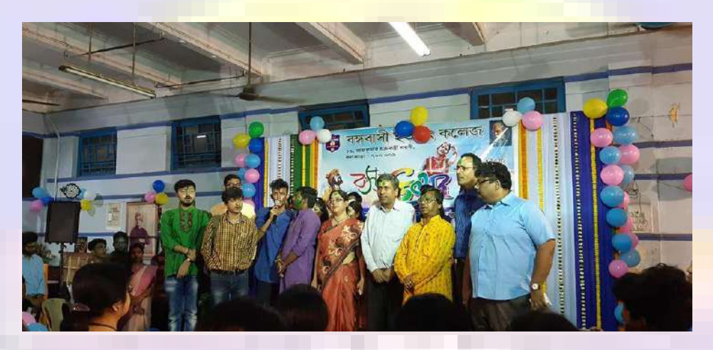
Celebration of "Basontotsob", the festival of colours