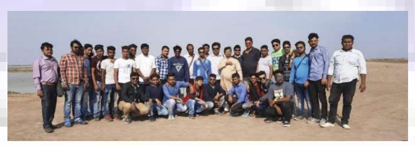
Academi Tour held at Gujrat (Rann of Kutch)

♦ Modern Instrumentation: The college has rich stock of modern instruments. This year it has obtained a Grant of about thirty lac from RUSA to purchase instruments. It has purchased several modern