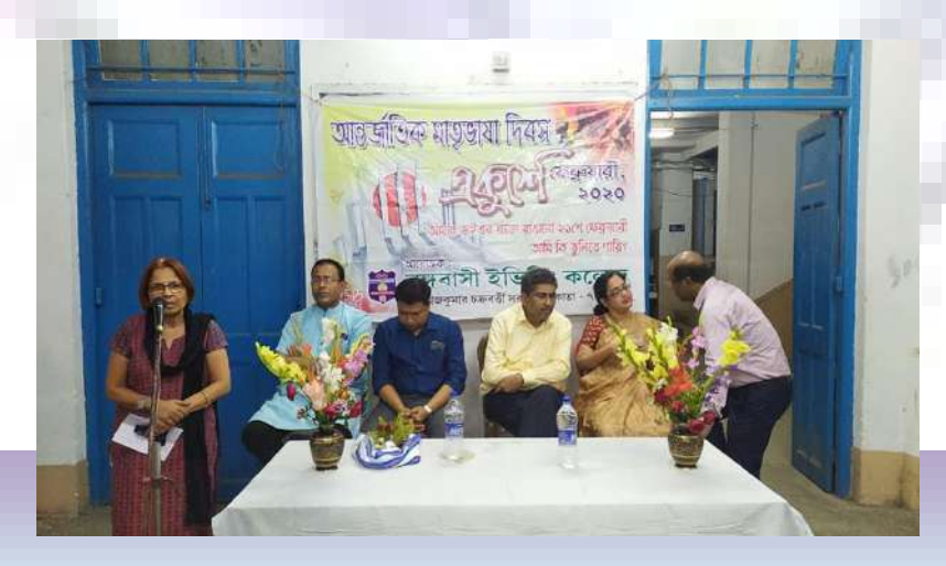
Observation of "Matribhasa Divas" (Day of Vernacular Language)