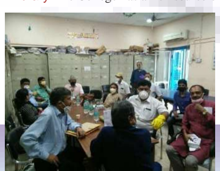
GB Meeting of the College with COVID19 precaution

*Library: The College has a rich source of books available in the