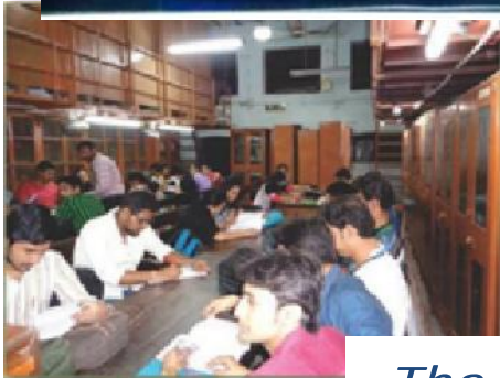
The College Library