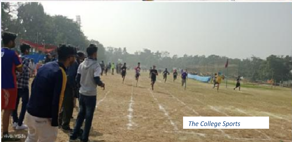
The College Sports