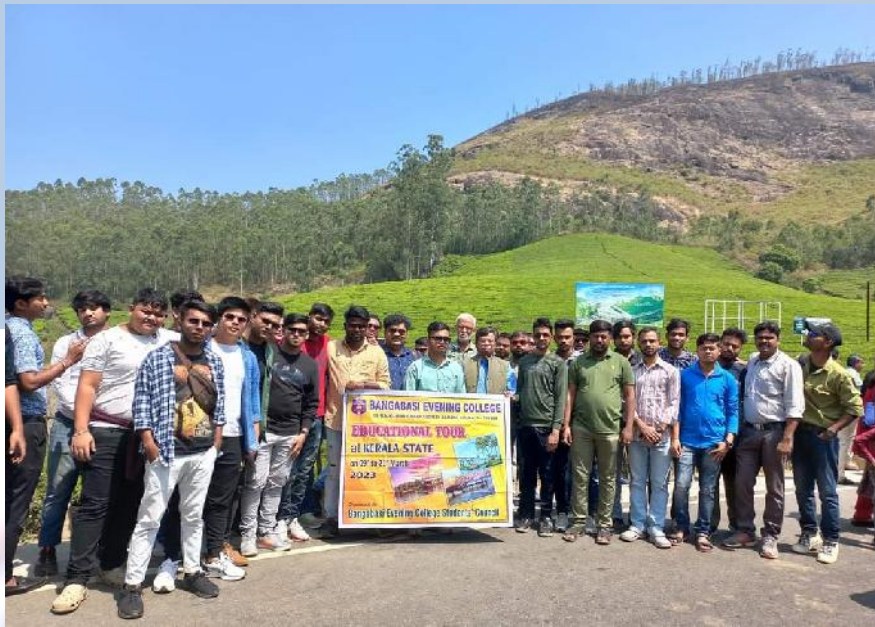
ACADEMIC TOUR AT KERALA ORGANIZED BY STUDENTS COUNCIL