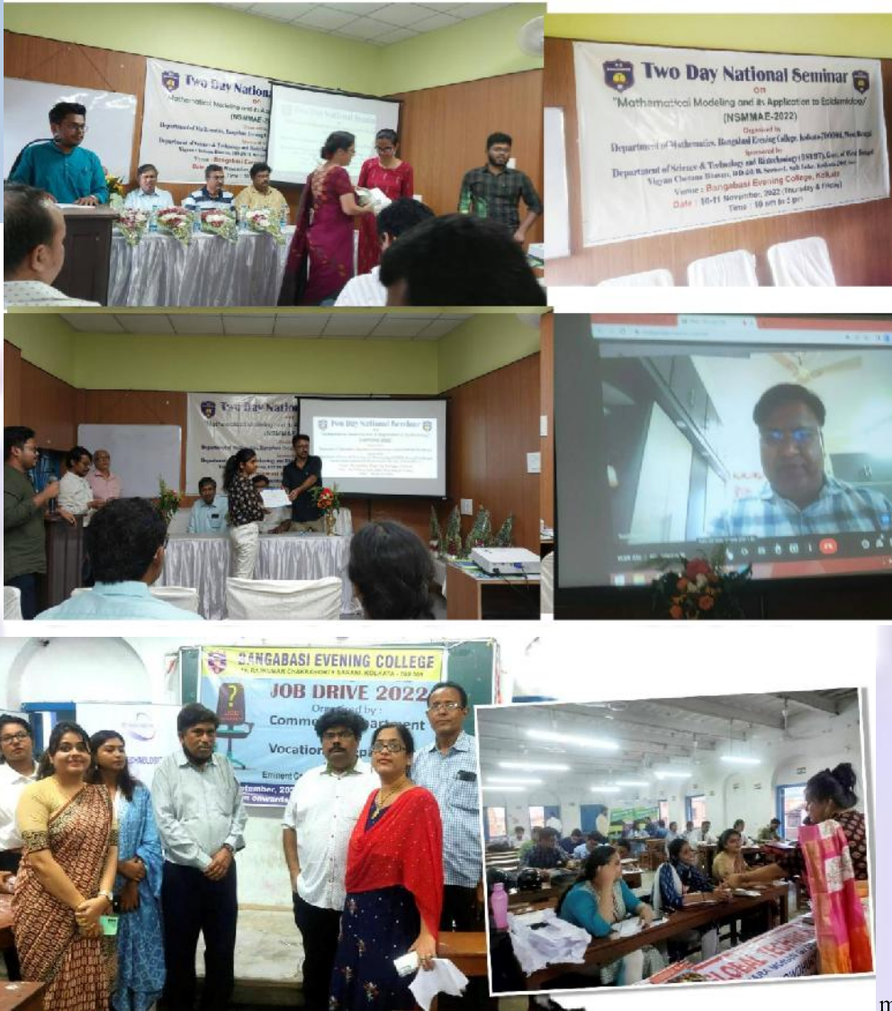
...m by the three companion colleges.