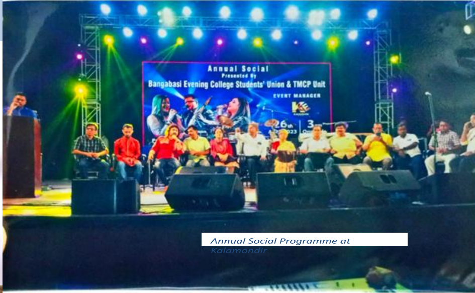
Annual Social Programme at Kalamandir

Formation of habits in civic responsibility, the broadening of outlook and sympathies through varied associations and