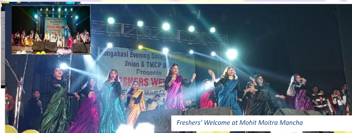
Freshers' Welcome at Mohit Moitra Mancha