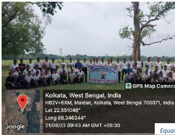
Equation Observation of International Yoga Day

corporate life in college. Apart from organizing various socio-cultural union plays a positive role in furthering programmes of the institution.