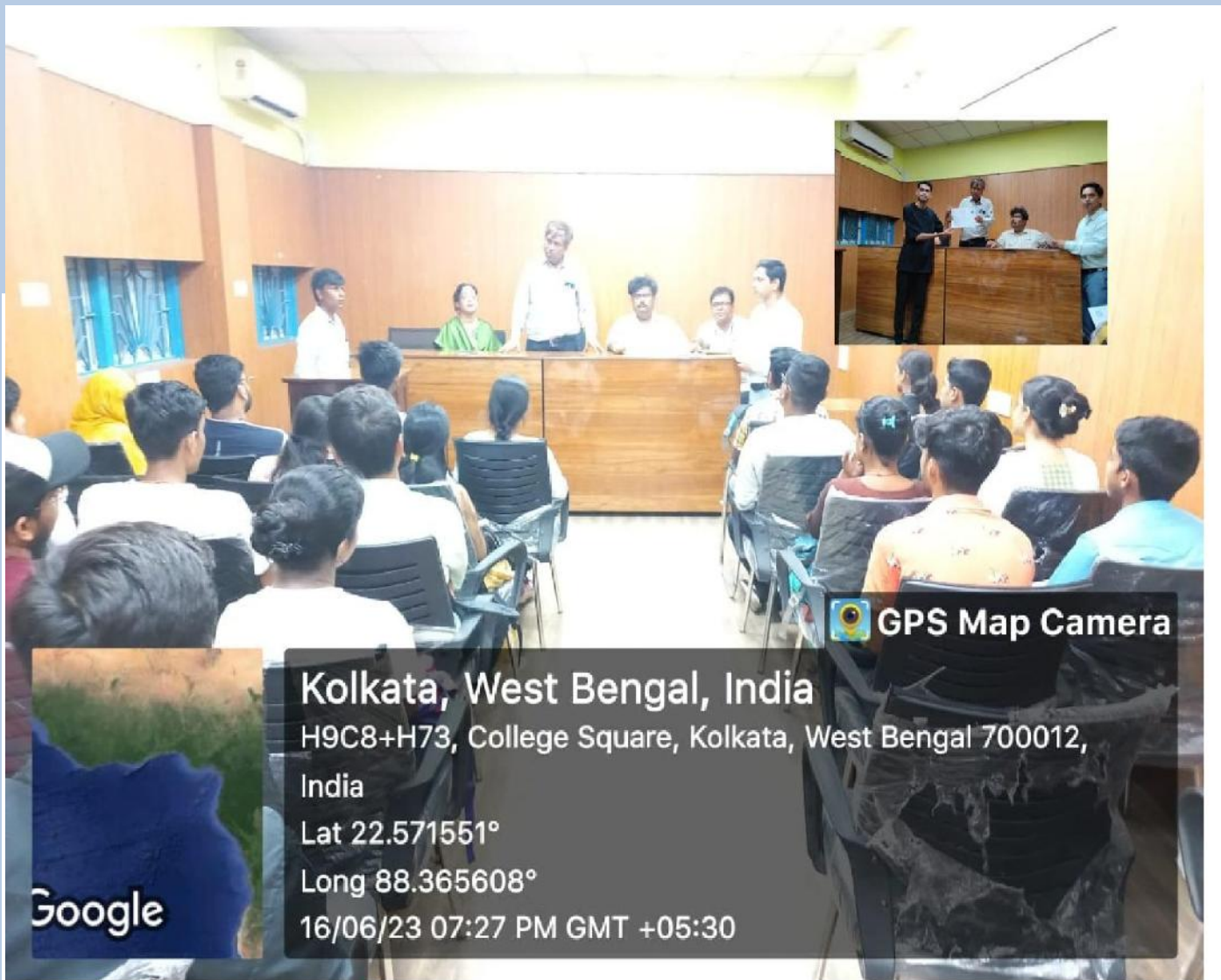
Distribution of certificates from Skill sector (Skill India/National Skill Development Corporation (NSDC) amongst the students of Bangabasi Evening College on 16.6.23.

❖ Modern Instrumentation: The college has a rich stock of modern instruments. This year it has obtained a Grant of about thirty lac from RUSA to purchase instruments. It has purchased several modern instruments including Double beam FT-IR Spectrometer, Spectrophotometer (UV - VIS), BOD Incubator, Microtome, refrigerated Centrifuge, different types of microscope, Digital Polarimeter, Digital Conductometer, Digital pH-meter, Digital balance, Digital Potentiometer and several others.