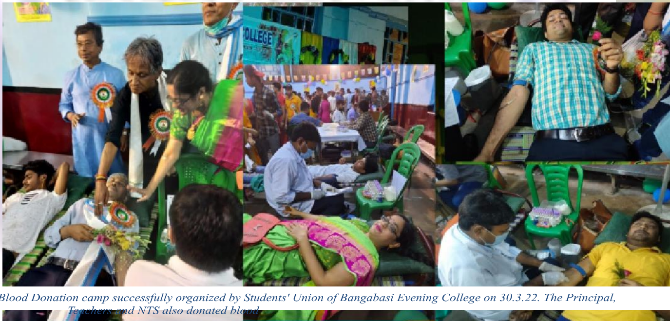
Blood Donation camp successfully organized by Students' Union of Bangabasi Evening College on 30.3.22. The Principal, Teachers and NTS also donated blood