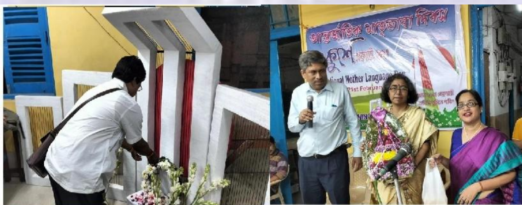
Observation of International Mother Language Day

The teachers have relentlessly performed their duties by taking classes through E-Sikshak2 and Zoom App from their houses and checking the